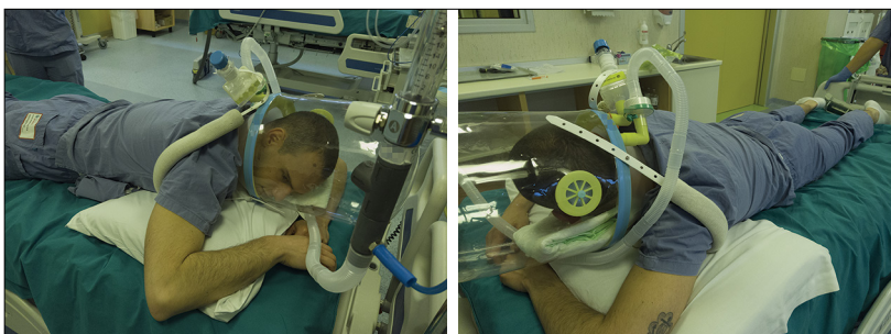
Figure 1: Prone positioning with a helmet interface to enable continuous positive airway pressure. Example demonstrated by volunteer.

The main study outcome was the change in oxygenation (arterial partial pressure of oxygen [PaO 2 ]/FiO 2 ratio) between timepoints SP1 and SP2, as an index of pulmonary recruitment.