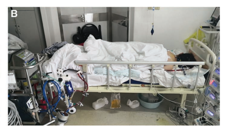
Fig. 9. Prone position ventilation for critically ill patients with COVID-19. ( A ) An intubated patient turned prone; ( B ) an intubated patient with extracorporeal membrane oxygenation support turned prone.