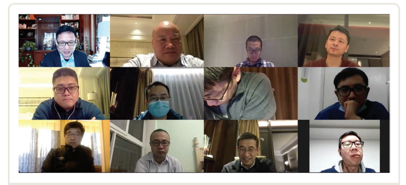
Fig. 2. Screenshot of the fourth webinar with live broadcast conducted on February 29, 2020. A total of 12 intensivists and anesthesiologists (10 people from China; 2 people from the United States) discussed the experience of using extracorporeal membrane oxygenation amid the COVID-19 outbreak. Nine of the 10 Chinese experts are currently working in Wuhan and taking care of critically ill patients with COVID-19. Most of these Chinese experts stay in hotels because they came from other provinces to Wuhan to share the workload that had overwhelmed the local teams.

COVID-19 is acute hypoxemic respiratory insufficiency or failure requiring oxygen and ventilation therapies (fig. 3).<sup>3,4</sup> A recent report showed that 14% of patients developed dyspnea, tachypnea with a respiratory rate greater than or equal to 30 per minute, desaturation with peripheral oxygen saturation (Spo<sub>2</sub>) less than or equal to 93%, poor oxygenation with a ratio of partial pressure of arterial oxygen (Pao<sub>2</sub>) to fraction of inspired oxygen (Fio<sub>2</sub>) less than 300 mmHg, or lung infiltrates greater than 50% within 48 h.1 ARDS occurred in 20% of the 138 patients hospitalized and in 61% of the 36 patients admitted to the intensive care unit (ICU) in Zhongnan Hospital in Wuhan.<sup>4</sup> Organ dysfunction, injury, or failure, excluding the lungs, is common. Cardiac injury occurred in 23%, liver injury in 29%, and acute kidney injury in 29% of critically ill patients.<sup>3</sup> Neurocognitive impairments occurred in more than one third of patients with advanced COVID-19.7